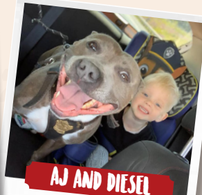
AJ AND DIESEL CHILD'S BEST FRIEND