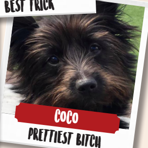
COCO PRETTIEST BITCH