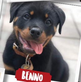
BENNO CUTEST PUPPY