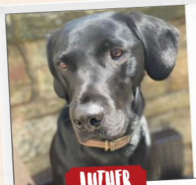
LUTHER MOST HANDSOME

We hope you all enjoyed the experience, and we look forward to seeing some of the dogs again next year when we host a "real" Dog Show!