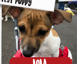
LOLA WAGGIEST TAIL