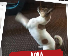
LOLA BEST TRICK