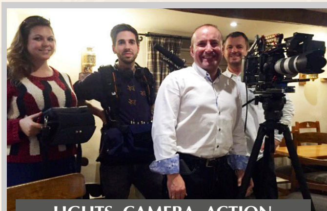
LIGHTS, CAMERA, ACTION

Welcome to the anniversary edition of the Dog's Life. In this issue we look back at the developments, achievements and events over the past 12 months, since opening our doors on the 11th December 2015.