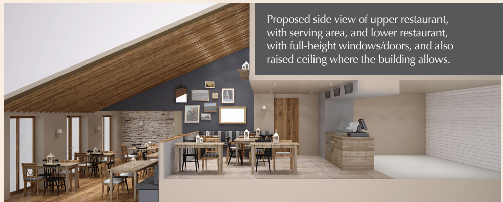
Proposed side view of upper restaurant, with serving area, and lower restaurant, with full-height windows/doors, and also raised ceiling where the building allows.