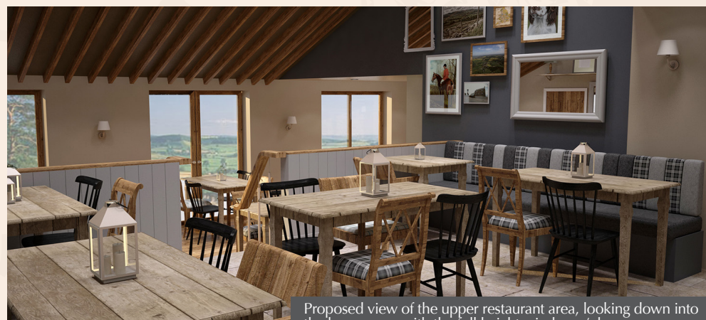
Proposed view of the upper restaurant area, looking down into the lower area, with the full height windows / doors.