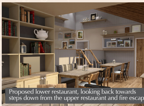
Proposed lower restaurant, looking back towards steps down from the upper restaurant and fire escape.