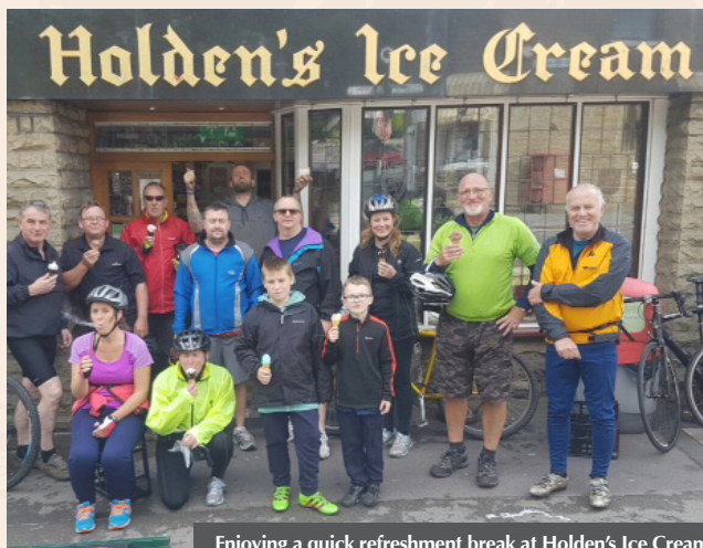
Enjoying a quick refreshment break at Holden's Ice Creams

Anyone interested in this please email: admin@thedoginnatbelthorn.net and supply details of your produce you would like to sell in our shop.