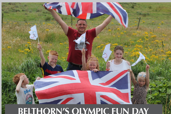
BELTHORN'S OLYMPIC FUN DAY

Welcome to the 5th Dog's Life. In this issue, we provide some feedback from our 1st AGM and your comments & suggestions. We introduce our members of staff and we report on a hugely successful 'Pioneer Pubs Event' which the Dog Inn co-hosted.